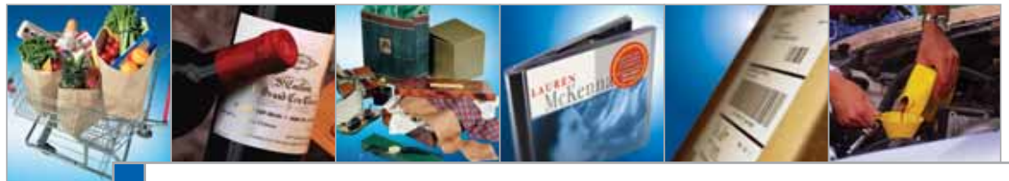
3138-N Dual Action Tamp