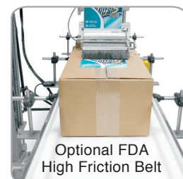
Optional FDA High Friction Belt