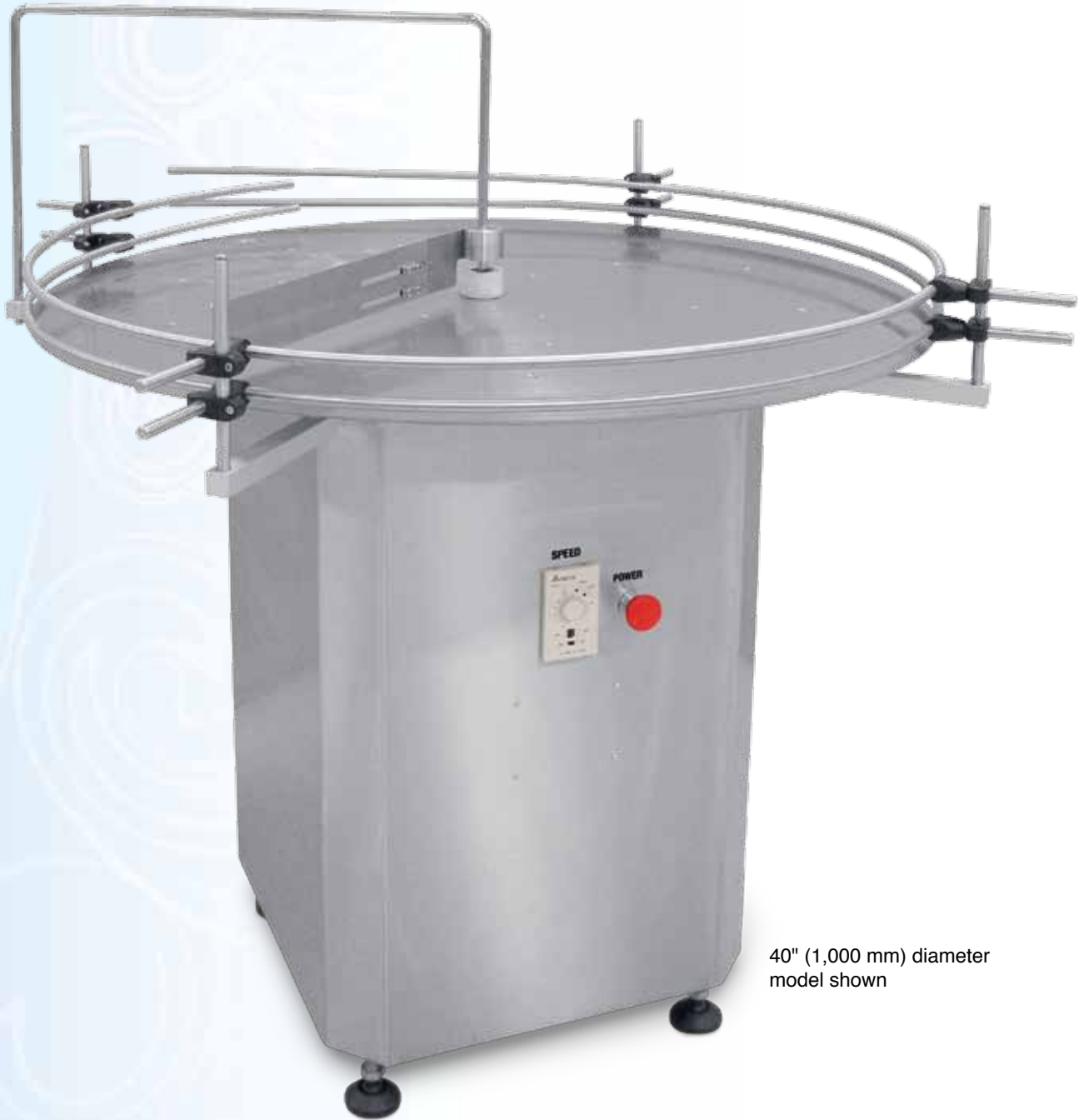
40" (1,000 mm) diameter model shown